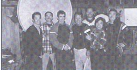
Together with Hibiki Daiko and Japan's biggest Uchiwa (fan drum).

Watching his fantastic performances coupled with the regular interruptions of his students, radio and newspapers telephoning and faxing made me realise how special my host, teacher and friend really is, and how honoured I should be to learn from him.