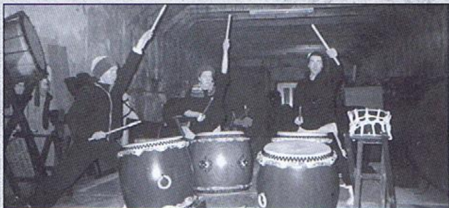
Above: Rehearsals in the Dojo