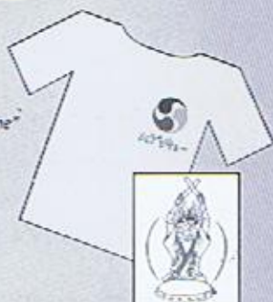
Back of T-shirt