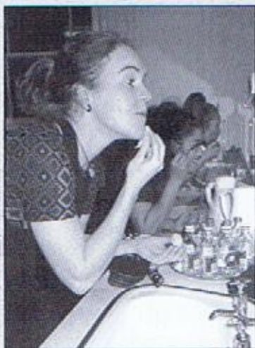
Above: The girls get ready!