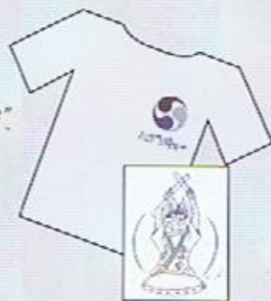
Back of T-shirt