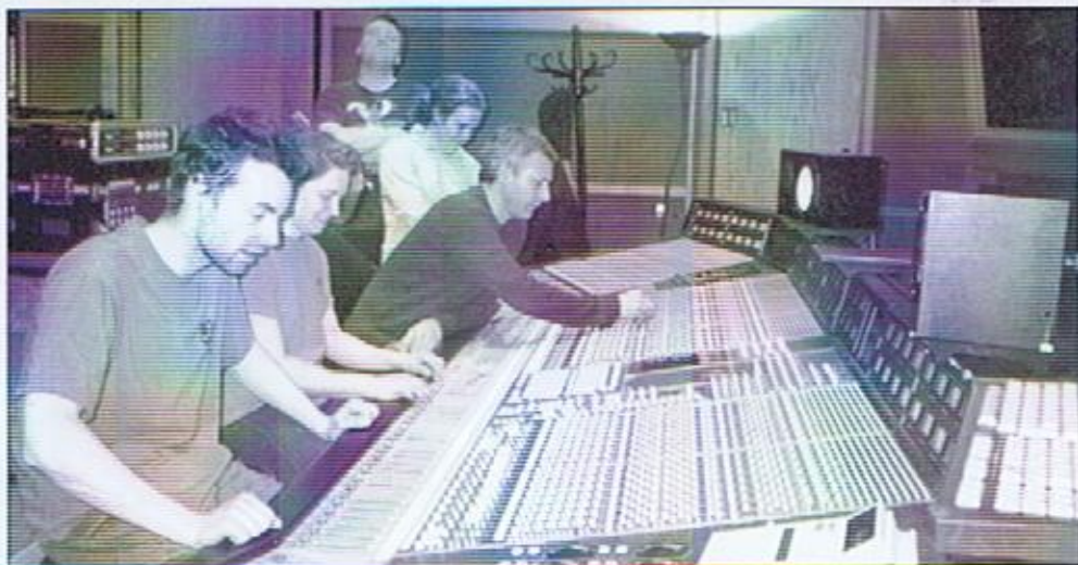
Bottom: "Beam me up Scotty!" On the bridge at Townhouse Studios in London, recording for the Brit Awards