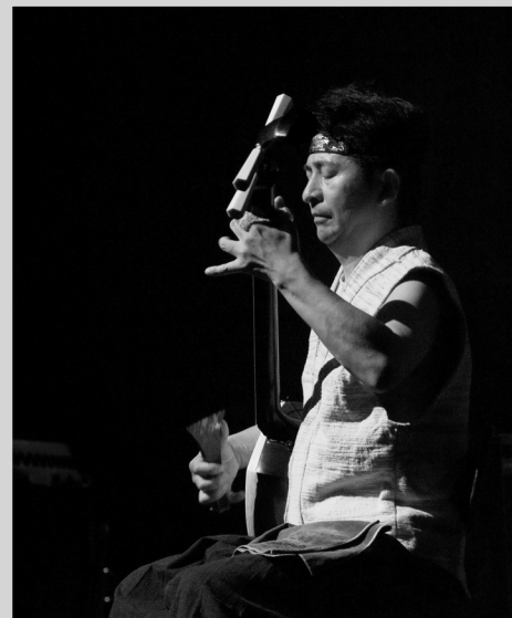
A virtuoso Shamisen performance