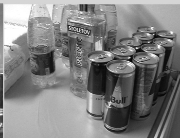
THE DRESSING ROOM RIDER