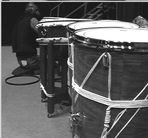
TAIKO-ESQUE DRUM KITS