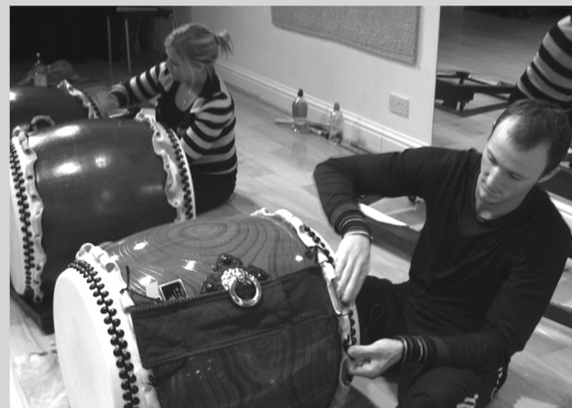
CLEANING THE DRUMS BEFORE THE TOUR

For more info: http://landofthekami.wordpress.com http://www.youtube.com/ACTIFProductions