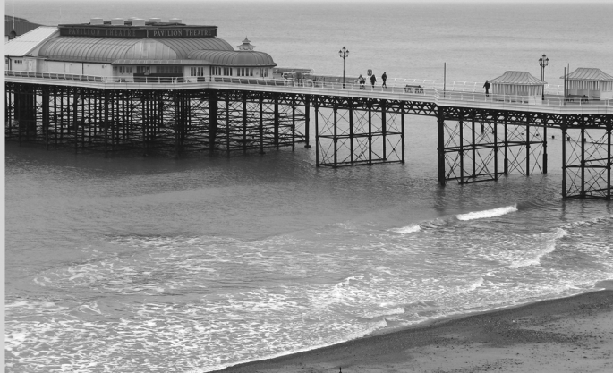
THEATRE ON CROMER PIER