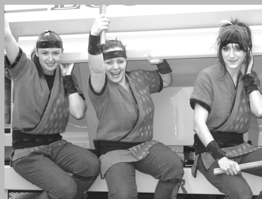
GALS ON TOUR

See enclosed leaflet for details of our forthcoming "Way of the Drum" tour.