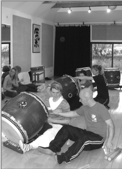
TEAMBUILDING WITH THE SCOTTISH DIRECTORATE

More courses are planned for the future. Watch this space!