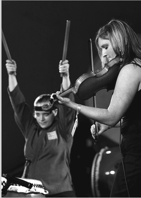
Fiddling with "Ikkyo"

A first-time collaboration with Indian artists and traditional Scottish music was premiered at the Edinburgh Mela in August. A new composition, commissioned by the Mela and supported by the Edinburgh Expo Fund, the collaboration involved tabla, Indian singing, pipes, harp, fiddle, gaelic song, shinobue and taiko drumming. Exploratory rehearsals started in April and June, while lineups were being finalised, and to see what kinds of instrument combinations might work. In July we had small group rehearsals, to develop ideas, and then in August, full group rehearsals to pull the piece together. The piece evolved into a 50 minute performance, premiered at the Edinburgh Mela Festival. Technical challenges faced during the rehearsals included how to balance the quieter instruments such as harp and tabla with the loud pipes and even louder taiko drums. Another challenge was arranging the performance so that all 3 cultural traditions were well represented, and that 14 musicians involved could shine individually within the collaboration. It was a huge challenge to bring together the performance, and a big relief when it all clicked into place at the last. The two performances at the Mela were very well-received by the crowds, who especially went wild for the pipes & taiko combination. Yatra means "journey" in Sanskrit, and this performance will hopefully be the first step in an ongoing journey, exploring the possibilities with taiko fusion.