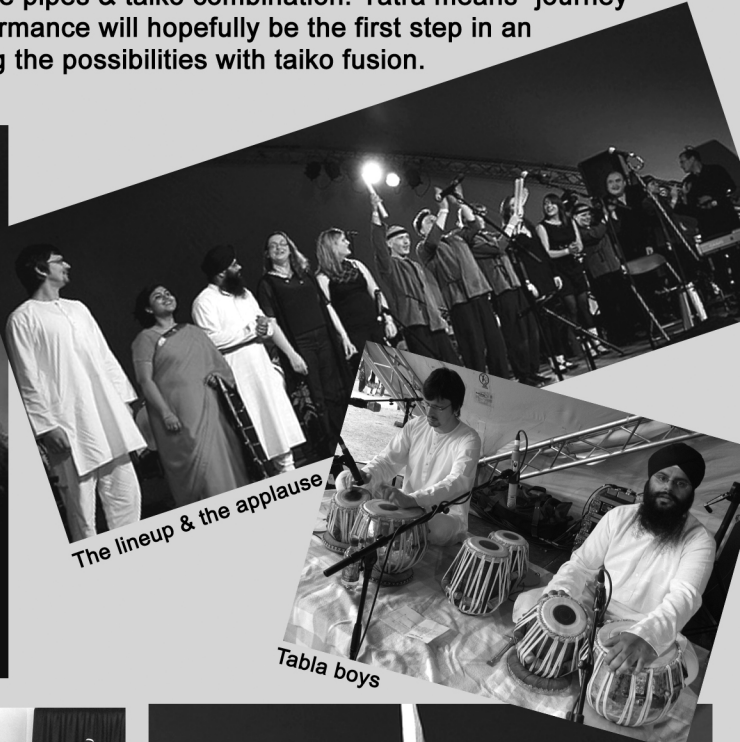
The lineup & the applause