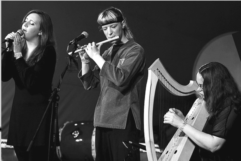
Gaelic song, shinobue & wire harp

A first-time collaboration with Indian artists and traditional Scottish music was premiered at the Edinburgh Mela in August. A new composition, commissioned by the Mela and supported by the Edinburgh Expo Fund, the collaboration involved tabla, Indian singing, pipes, harp, fiddle, gaelic song, shinobue and taiko drumming. Exploratory rehearsals started in April and June, while lineups were being finalised, and to see what kinds of instrument combinations might work. In July we had small group rehearsals, to develop ideas, and then in August, full group rehearsals to pull the piece together. The piece evolved into a 50 minute performance, premiered at the Edinburgh Mela Festival. Technical challenges faced during the rehearsals included how to balance the quieter instruments such as harp and tabla with the loud pipes and even louder taiko drums. Another challenge was arranging the performance so that all 3 cultural traditions were well represented, and that 14 musicians involved could shine individually within the collaboration. It was a huge challenge to bring together the performance, and a big relief when it all clicked into place at the last. The two performances at the Mela were very well-received by the crowds, who especially went wild for the pipes & taiko combination. Yatra means "journey" in Sanskrit, and this performance will hopefully be the first step in an ongoing journey, exploring the possibilities with taiko fusion.