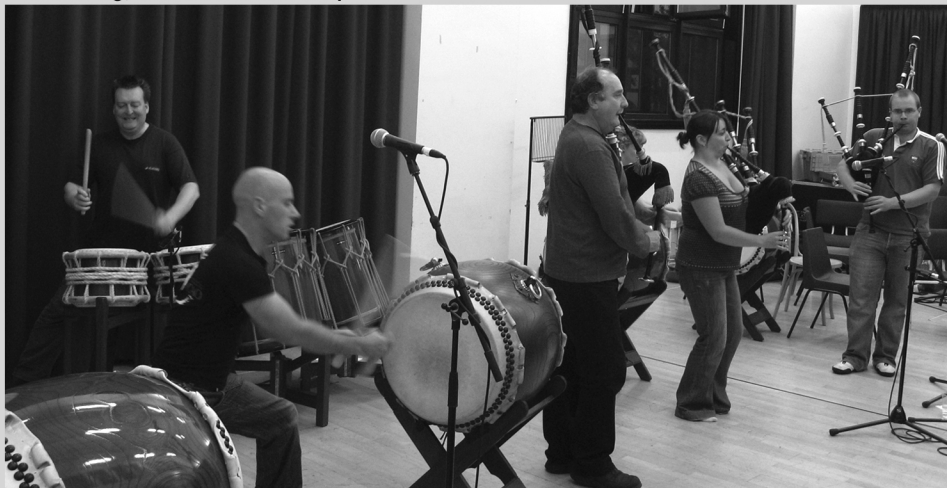
In rehearsal at the RSAMD.... pipes & taiko - a deafening combination!