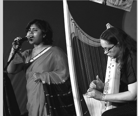
Indian song & bray harp