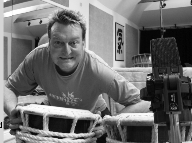
Our own recording studio in the Dojo