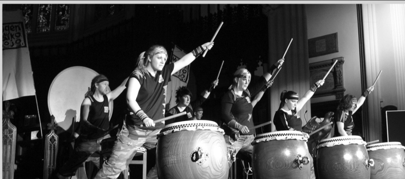
The Dojo Drummers thrill the Edinburgh audience