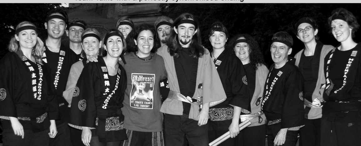
Course participants from Edinburgh & Glasgow, at their debut performance

As part of their eight-taiko-days-in-a-row run, Team Taiko followed performing at the Fringe with a performance at a wedding and at the annual Balloon Festival at our local village of Strathaven. On this weekend, the Mugen Taiko Dojo had a total of 37 taiko drummers performing simultaneously at two different events on the same evening!