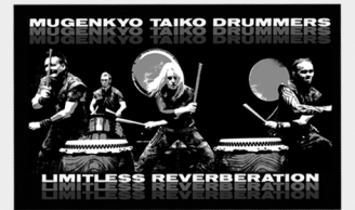
Large design on back